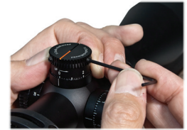
Align the elevation turret cap.