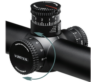
Turn Side Focus Knob

Parallax is a phenomenon that results when the target image does not quite fall on the same optical plane as the reticle within the scope. This can cause an apparent movement of the reticle in relation to the target if the shooter's eye is off-centered. Correctly focusing the target image will allow it to fall on the same optical plane as the reticle within the riflescope.