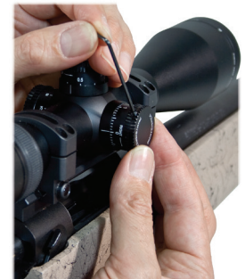
Align the windage turret cap.

Once the windage and elevation knobs are correctly indexed to the zero mark, temporary corrections can be safely dialed into the scope without worry of losing the original zero.