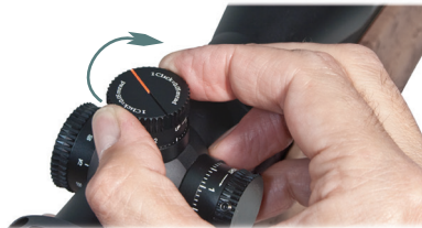
Point at which the knob stops turning.

Note: If re-zeroing at a future time, be sure to remove all CRS shims before sight-in.