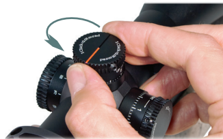
Correct alignment for zero point.